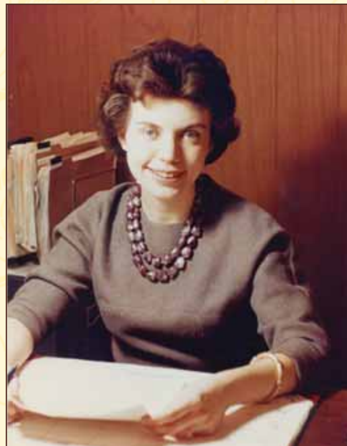
1963 at Holy Tree House, Fairfax, Virginia