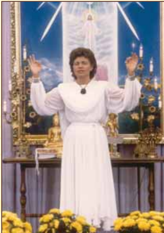
July 4, 1984, in the Heart of the Inner Retreat , dictation by Helios