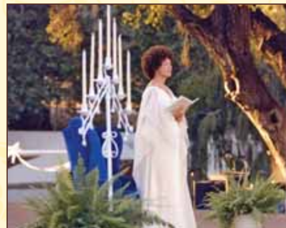
Service at Swan Lake, Camelot

Beautiful Dreamer, beautiful friend White fires of Micah thy unity blend. Seamless the garment, robe of pure white Blaze forth protection, God's blue cosmic Light!