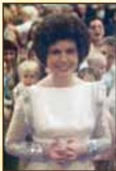
1980–81, New Year's conference, The Class of the Archangels

Zarathustra, Buddha dear Zarathustra Ah... Buddha dear Come.