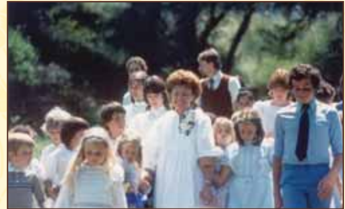
Mother's Day, May 8, 1983, walking down from Ascension Hill after Sunday service