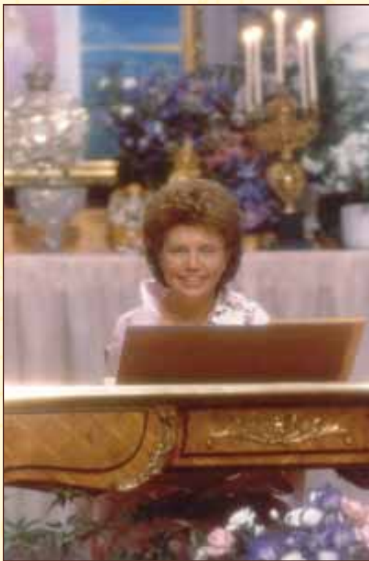
May 13, 1984, Chapel of the Holy Grail, Sunday service

Chorus: Alleluia, he is risen! Sing, ye angels, of Heaven's Son Alleluia, he is risen! Is risen, Love's victory won. Is risen, Love's victory won.