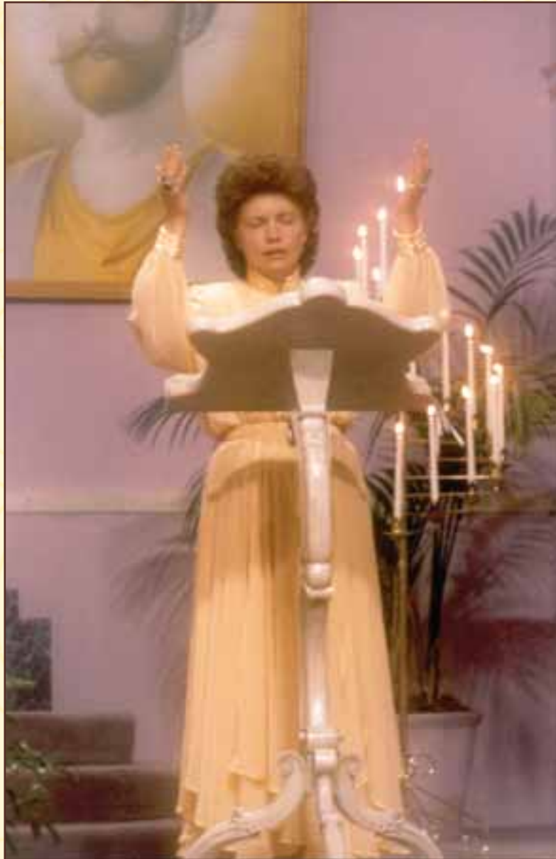
April 18, 1984, healing service in the Chapel of the Holy Grail, Camelot

In the name of the Father, of the Mother, of the Son and of the Holy Spirit, we thank thee, O God, for thy infinite mercy unto all. Amen.