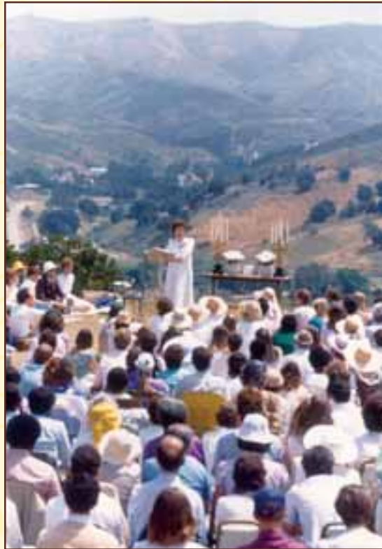
June 12, 1983, Sunday service on top of Ascension Hill at Camelot